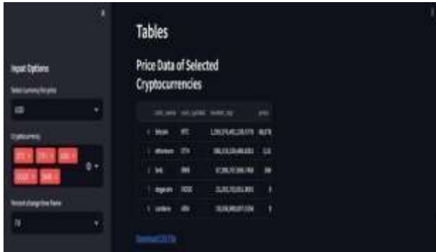
Fig. 7. Downloadable CSV Data.