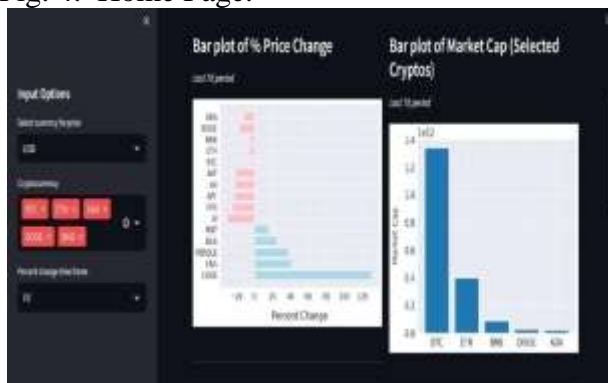
Fig. 5. Visualizations.