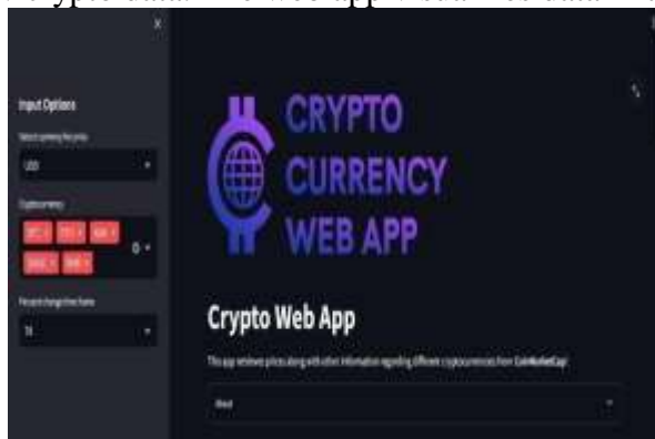
Fig. 4. Home Page.

The results and discussion section explains the web apps's result that is analysis and visualization of raw crypto data. The web app visualizes data in the form of bar graphs, line graphs and pie charts.